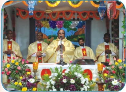
05.05.2026 - Feast Mass, Kodungavayal, Puliyaal