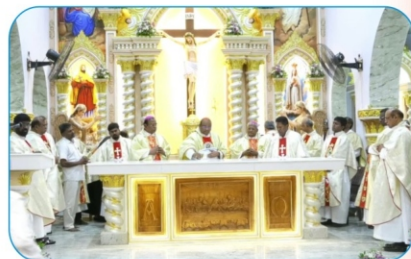
Renovated Church Blessing, Andichurani