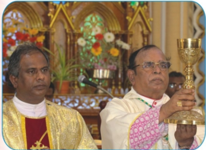
01.05.2026 - First Friday Mass, Idaikattur