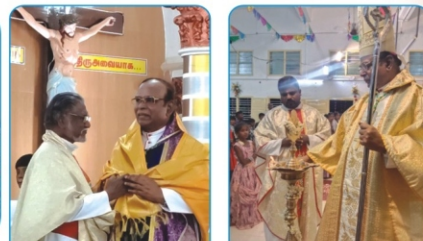
20.05.2026 - Requiem Mass, Sarugani, 23.05.2026 - Feast Mass, Kalladipatty, Madurai