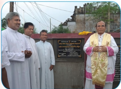
16.05.2026 - Flag Post Blessing & Mass, Uthayanoor, Suranam