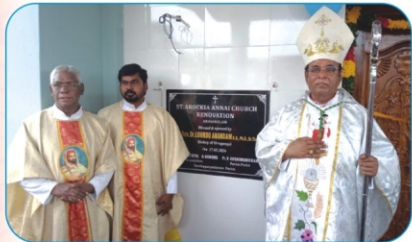
17.05.2026 - Renovated Church Blessing, Arasakulam, Susaiapparpattanam