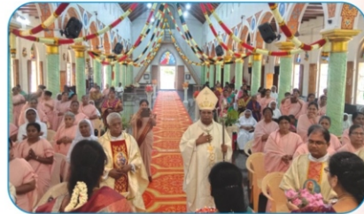
19.05.2026 - Centenary Mass, CIC Convent, Susaiapparpattanam