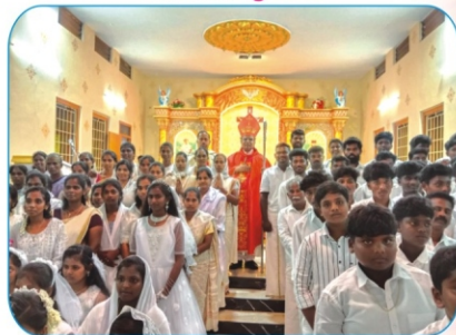
21.05.2026 - Confirmation, Thiruvetriyur