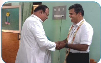
Visit of new Archbishop Susai Jesu