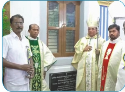
09.05.2026 - New Church Blessing, Pulikulam, Devakottai