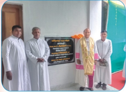
04.05.2026 - Flag Hosting & Blessing of Multipurpose Hall, Sambai