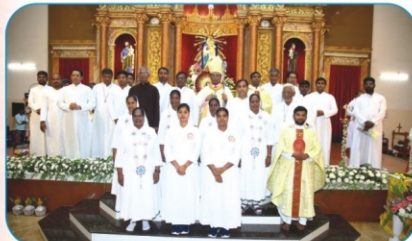
Sisters of Jesus - Jubilee Mass, Thanjavur