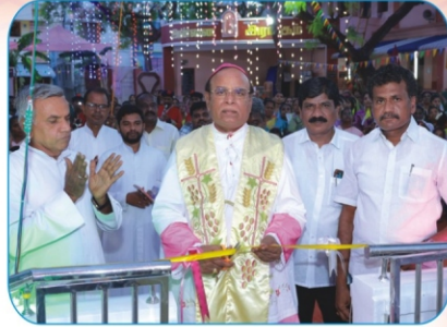
07.05.2026 - Flag Post Blessing, Rajakembiram